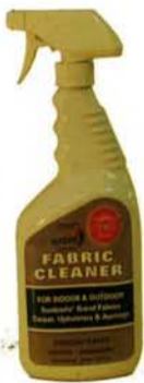
SunBrella Fabric Cleaner $13.99