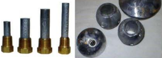
Zincs for shaft, rudder and outdrive. Pencil zincs also in stock! Most sizes available $1.99 and up

High Quality Shields Marine Water, Sanitation, Cooling and Fuel Hose We have virtually any size you need