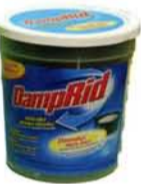
DampRid Moisture absorber $4.99