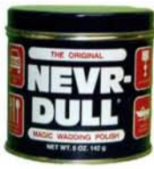
The Original Never-Dull Polish $6.99