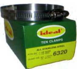
Stainless Hose Clamps All common sizes. $.99 to $4.99