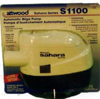
Atwood Sahara 1,100 GPH Completely Automatic Bilge Pump. No external float switch needed. $84.99