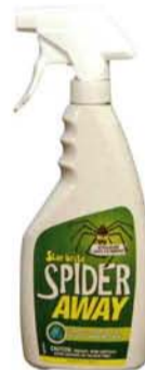
Starbrite Spider Away $11.99