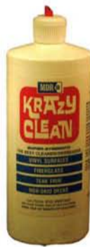
Krazy Clean Cleaner Degreaser $9.99