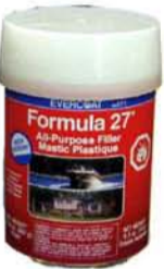
Formula 27 All purpose filler 14.7 oz. $9.99