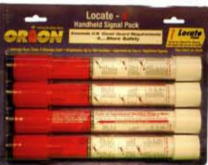
Orion Red Signal Flares. (White also available) Check the expiration on yours! $19.99

Stuffing Box Leaking? PTFE flax shaft packing in all common sizes