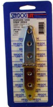
Stainless hinges and scores of other quality stainless fittings and hardware from Sea Dog. See our store display