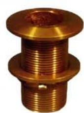
Bronze Thru-hulls with ground terminal. We have several types and diameters. From $19.99