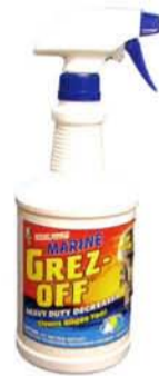
Marine Grez-Off Works great in bilges. $7.99