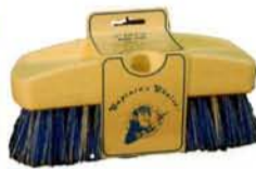
Deck Brush $11.99