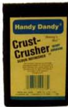
"Crust Crusher" abrasive sponges $3.49