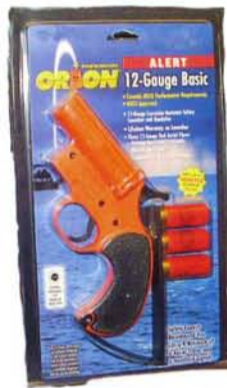
Orion 12 Gauge Signal Flares Check the expiration on yours! $39.99