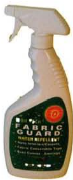
"303" Fabric Guard 32 oz $23.99