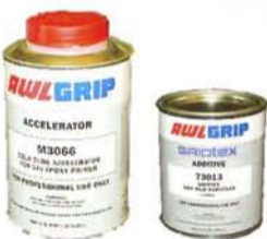
AwlGrip Paint and additives. We'll order the color(s) you want.

Stuffing Box Leaking? PTFE flax shaft packing in all common sizes