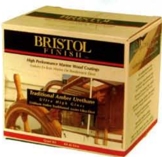
Bristol High Performance marine wood finish $64.99