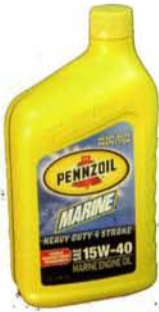
Motor Oil for gas and diesel As low as $3.99 Quart