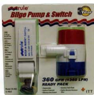
Rule 360 GPH Pump & Mercury-Free Switch. $47.99