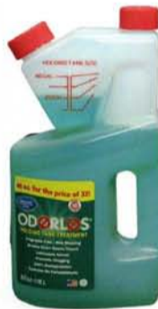
ODORLOS Holding Tank Treatment 100% biodegradable $15.99