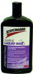
Scotchgard Marine Liquid Wax $25.99 one liter $15.99 500 ML