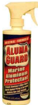
Aluma Guard This is the good stuff for aluminum and other metals $15.99