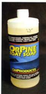
OrPine Boat Soap $16.99