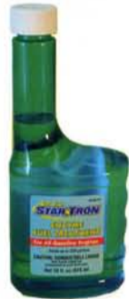
StarTron Enzyme Fuel Treatment 8 oz $8.99 gas 16 oz $12.99 gas 32 oz $21.99 gas 8 oz $11.99 diesel 16 oz $15.99 diesel 32 oz $27.99 diesel