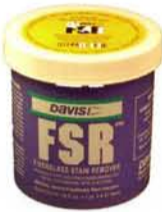
Davis Fiberglass Stain Remover Removes oil, rust and exhaust stains from fiberglass, metal and white painted surfaces $11.99