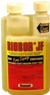
BioBor JF Diesel Fuel Treatment $19.99