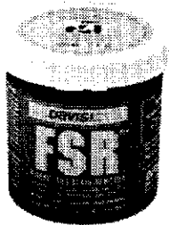
Davis Fiberglass Stain Remover This removes the toughest stains without damaging the gelcoat.

Doing things in the fall will save a lot of time in the spring —Boats get dirty and sometimes even moldy during the summer and all of it will be worse after a winter of storage. The time to do a thorough cleaning is before you shrink wrap or cover the boat with a tarp. Visit our marine store and you'll find everything you need to remove stains from gelcoat, get rid of mold and mildew, clean interior surfaces and even waterproof bimini tops.