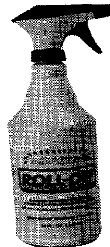
Amazing Roll-Off Absolutely the best general cleaner around. We sell cases of this stuff!