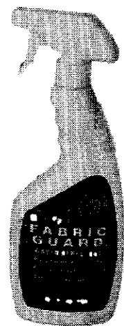
303 High Tech Fabric Guard Great for re-waterproofing bimini tops and mooring covers.