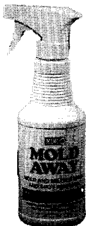
MOLD AWAY Mold, mildew and spot remover